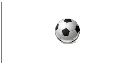
GCFC PATIO PROGRAM 2010

submitted drawings to the City of Gosnells. The patio will bring welcomed shade from the sun and cover from the rain throughout the year providing greater comfort for all members